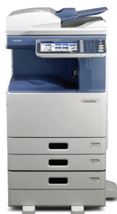
e-STUDIO5055c with Paper Feed Pedestal.