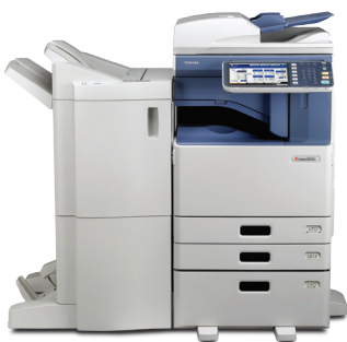
e-STUDIO5055c with Saddle-Stitch Finisher.